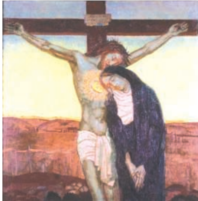
Painting by Maurice Denis 1916

Importance: Devotion to the Sacred Heart of Jesus is intimately associated with the most fundamental teachings of the Gospel: (1) Jesus is the revelation of the Father's infinite love in Person. (2) As true God and true Man he has a personal interest in every human being. (3) This love was seen from the very outset to be symbolized in Christ's human heart.